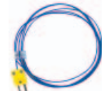
K type thermocouple cable [DME1600-OPT11]