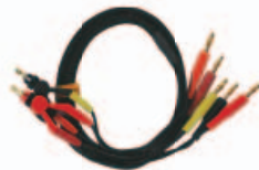
Kelvin probe (for 4-wire resistance measurement) [DME1600-OPT07]